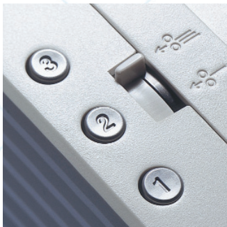
Scan-To-Job Buttons for One-Touch Operation

The DR-2580C scanner is not only one of the smallest and most versatile in its class, but it's also incredibly easy to use.