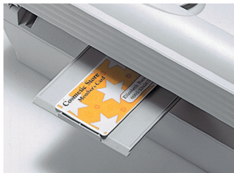
Straight Path for Card Scanning

The DR-2580C scanner also includes the Rapid Recovery System, which sends only completed image data to the application software, offering seamless scanning operation should a feeding error occur. And the Punch Hole Removal function removes the black dots that appear when scanning pages from booklets or binders.