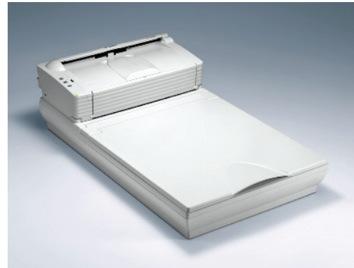
DR-2580C Scanner with Optional Flatbed Scanner

Compact, powerful, and fast. The Canon imageFORMULA DR-2580C color scanner is designed to meet the diverse imaging needs of any busy office. This innovative scanner offers the most advanced features in document scanning. Boasting record speeds for scanning and saving to searchable PDF has earned the DR-2580C scanner PC Magazine's Editors' Choice award and the Buyers Laboratory Inc. "Recommended" award. Not surprising since it's from Canon, the brand the world relies on for the latest solutions in imaging technology.